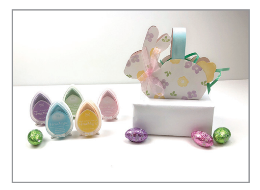
Step 8 - Now that you have made your bunny basket, it's time to fill it up with goodies!