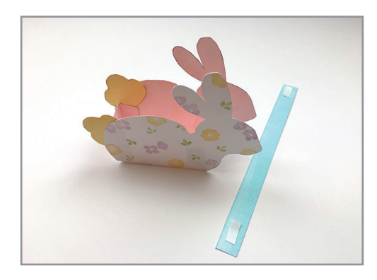
Step 7 - Attach tails and basket handle.