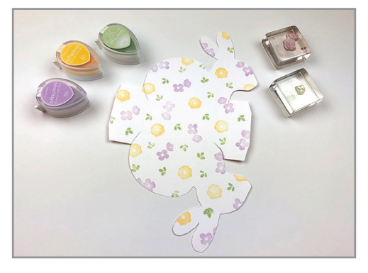
Step 5 - Repeat until the entire area has a nice design.