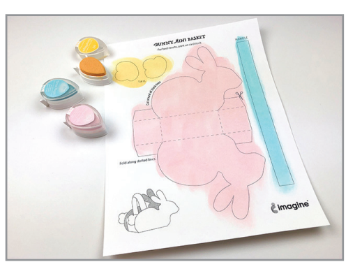
Step 2 - Before cutting, color the pieces with your VersaMagic Dew Drops ink pads. These pieces make the inner side of the basket.