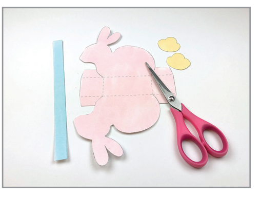
Step 3 - Following the solid black line, cut out all the shapes. If you like, you can paint both sides of the basket handle and tails.