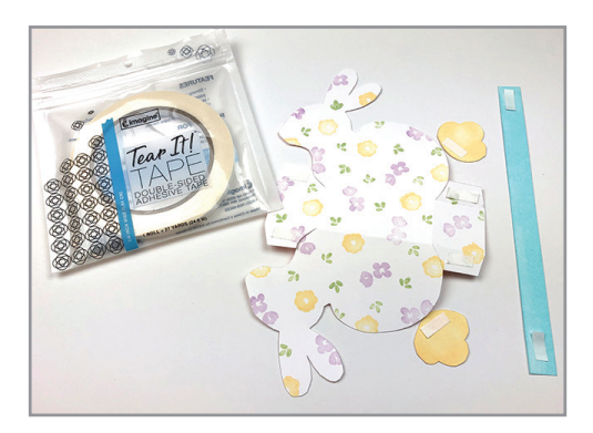
Step 6 - Fold along dotted lines to make a crease. Place small pieces of of Tear It! Tape as shown.